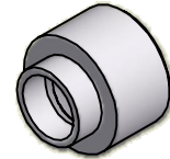
ISO SCALE 2 : 1