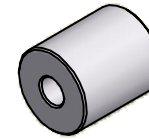
ISO SCALE 1 : 1