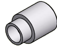
ISO SCALE 3 : 1