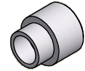
ISO SCALE 3 : 1