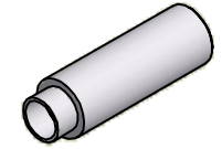
ISO SCALE 1 : 1