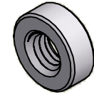
ISO SCALE 2 : 1