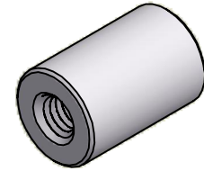
ISO SCALE 2 : 1