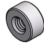
ISO SCALE 2 : 1