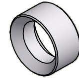
ISO SCALE 3 : 1