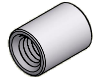
ISO SCALE 3 : 1