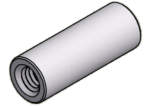
ISO SCALE 3 : 1