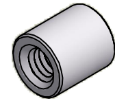
ISO SCALE 3 : 1