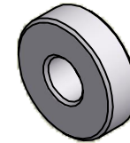
ISO SCALE 2 : 1