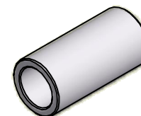
ISO SCALE 2 : 1