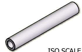
ISO SCALE 1 : 1