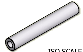
ISO SCALE 1 : 1